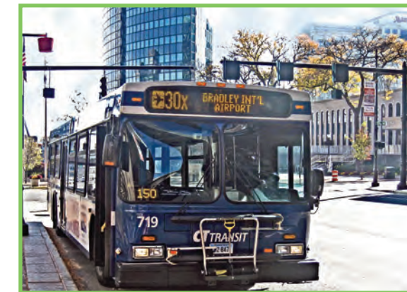
Bus stop at Central Row in downtown Hartford

Passengers are responsible for their luggage, if any. The semi-express, limited-stop trip between downtown and the airport only takes about 30 minutes ( see schedule on reverse ).